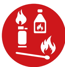
Flammable Liquids and Flammable Solids