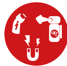
Miscellaneous Dangerous Goods