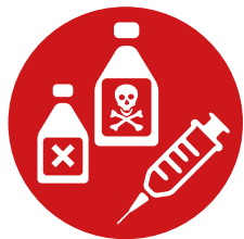
Toxic and Infectious Substances